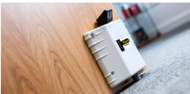
Dorgard SmartSound Fire Door Retainer

Dorgard SmartSound is a wireless fire door retainer that holds open fire doors. Installed onto the bottom of the fire door in under five minutes, Dorgard SmartSound will release to close the doors upon the sound of the fire alarm.