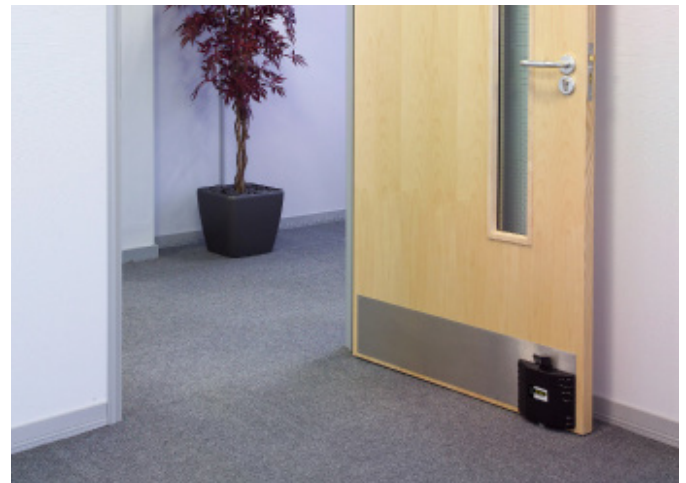
Hold your fire doors open safely and legally

Since having them installed, the client has great confidence in Dorgard. “Every time we test the alarms the product works. In case of an actual emergency