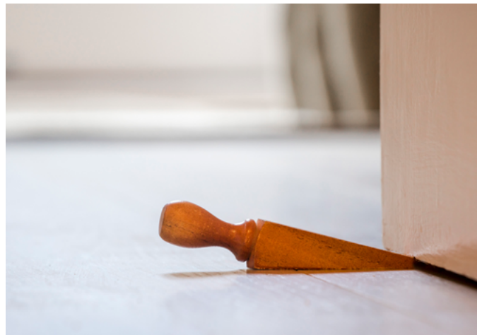
Wedged doors put people and property at risk.

The Government has stressed the importance of good ventilation as a way of reducing the spread of Covid-19. Not all schools have suitable air conditioning units in place and buying new ones can be very costly. Pete explained that “The school was having to wedge open internal fire doors in order to allow airflow throughout the school and reduce the risk of Covid-19.”