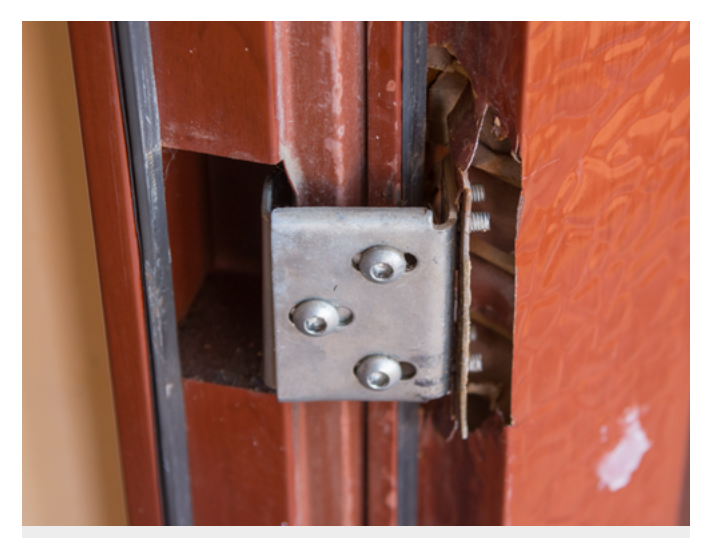
Fire doors will only protect your building if they're compliant.

Angel Ibayan, Mabbs Hall's Manager, asked the maintenance team to fix it temporarily but she knew it needed to be replaced as soon as possible to keep up with compliance, so started requesting quotes.