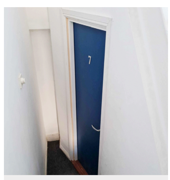
The completed installation

They were happy with the price that was provided and found the selection of doors to choose from was excellent.