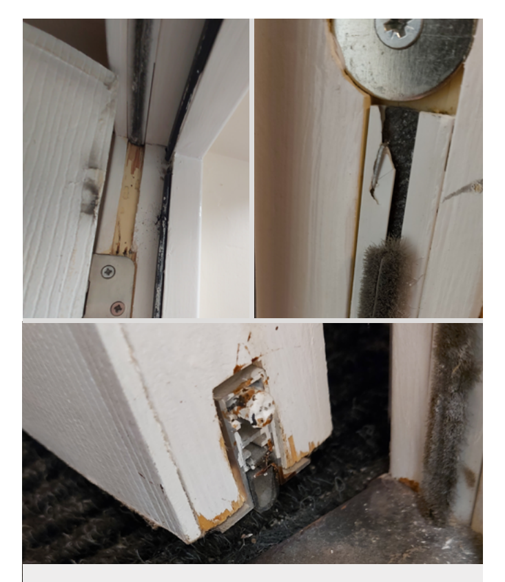
Professional fire door inspections help to identify non-compliances you may not know are there