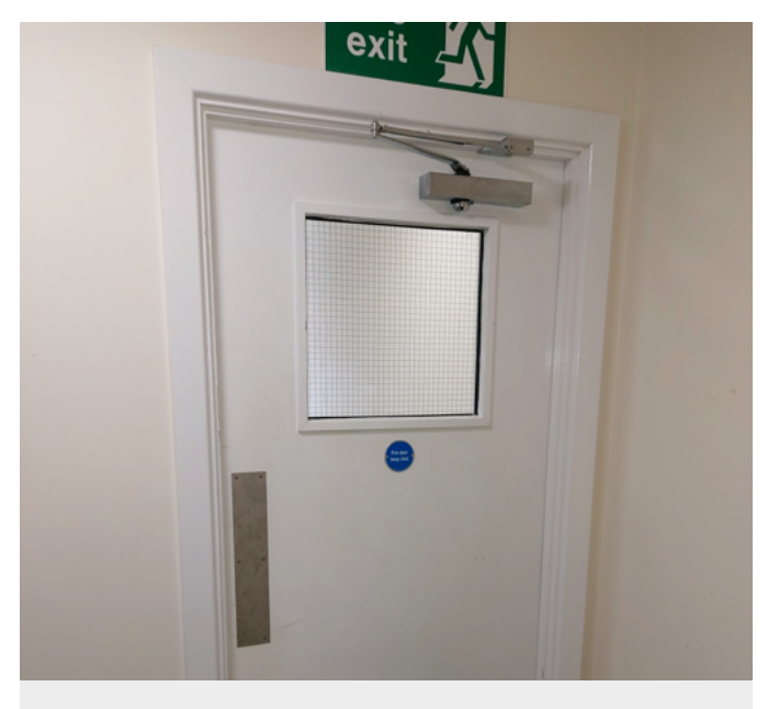
Compliant fire doors are essential in keeping your building fire safe

The Guinness Partnership hired another company to come and fit fire doors in some of their properties. Unfortunately the contractor they hired fitted fire doors with lots of errors and they weren't fit for purpose, they didn't have overhead door closers and the surrounds weren't fitted.