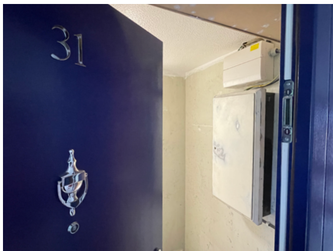
Remedial work was needed on electrical wires within the flat before the new doorset could be installed.