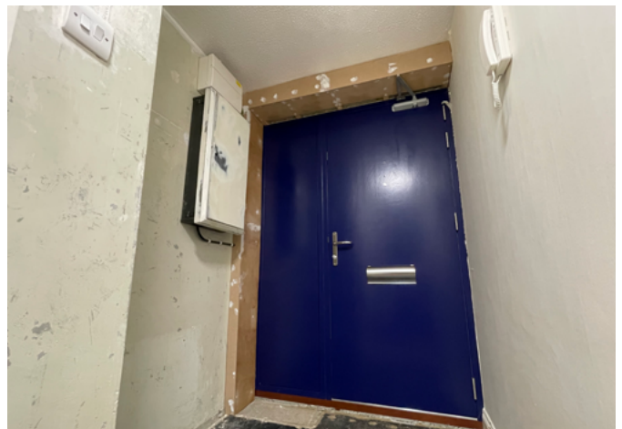
The complete doorset install from the inside of the property.