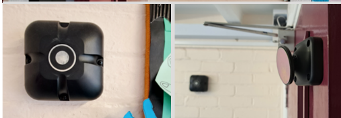
DorMag can be easily installed in multiple positions behind the door

The school has been very pleased with the results. Sharon says, “After having the DorMags fitted, it became