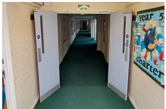
Fire doors at Eastbrook are now held open safely by DorMag Pro

“A parent knew about Fireco and put us in the right direction. We were very pleased that he did.”