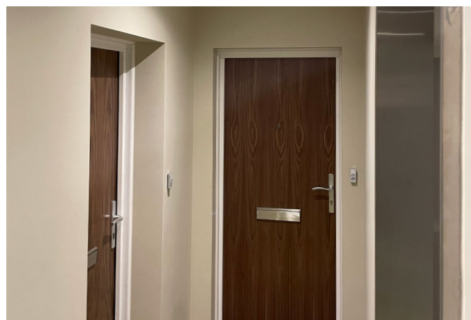
FD30S walnut veneer fire doors were installed

“We contacted around a dozen companies that supply and install fire doors,” continues Sima. “But either they were too slow to respond, didn't respond at all, didn't supply the full specification that we were looking for, and didn't fill us with confidence.”