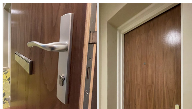
Each door had fire-rated hardware installed, including concealed door closers

The veneer doors themselves are beautiful, and best of all are their incredible acoustic and draught insulation qualities.”